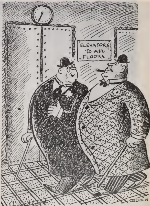
"I tell you, I just can't make up my mind—Truman, Taft, Dewey, MacArthur. . . ."