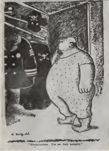
"Mmmmmmm. I'm on tudy weight."