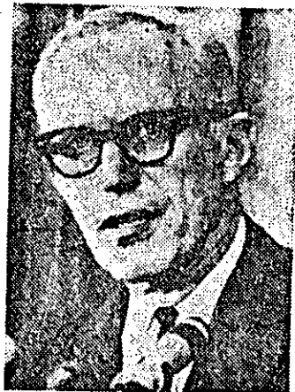
JAMES E. ALLEN JR.

include the Labor Department, with its manpower training programs, and the Office of Economic Opportunity.